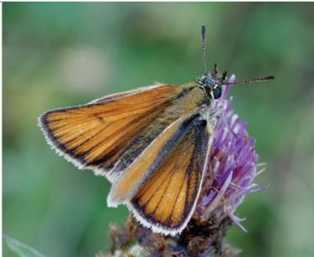
Female Essex Skipper feeding.

The other golden skippers, especially the Small Skipper .