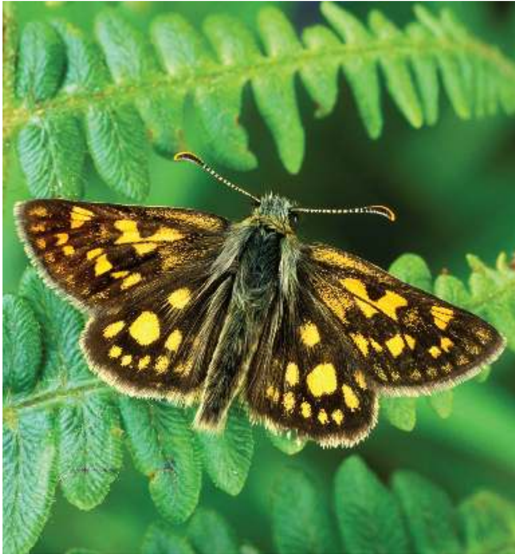
Chequered Skipper basking, West Scotland.

Within Britain, if you are lucky enough to see it, this species is unmistakable. However, in north-western Europe there are two rather similar species. The Northern Chequered Skipper C. silvicolus differs in that males are largely yellowish-brown above with a few dark forewing spots and dark shaded areas on the hindwings; females are more like Chequered Skippers, but have distinctly larger areas of yellow. This is a strongly northern species, becoming steadily more frequent from northern Germany northwards in damp meadows and woodland clearings. The Large Chequered Skipper Heteropterus morpheus is quite distinctive by virtue of its uniformly dark brown upper surfaces with just a few white spots on the forewings (more in the female than in the male), and with underside hindwings boldly marked with large, black-edged, oval white spots on a yellowish background. It also has a rather distinctive and curious bouncing flight, low over the ground. The species is locally common in sheltered damp meadows and wet heaths, from western France to southern Scandinavia in our area, flying late June–early August.