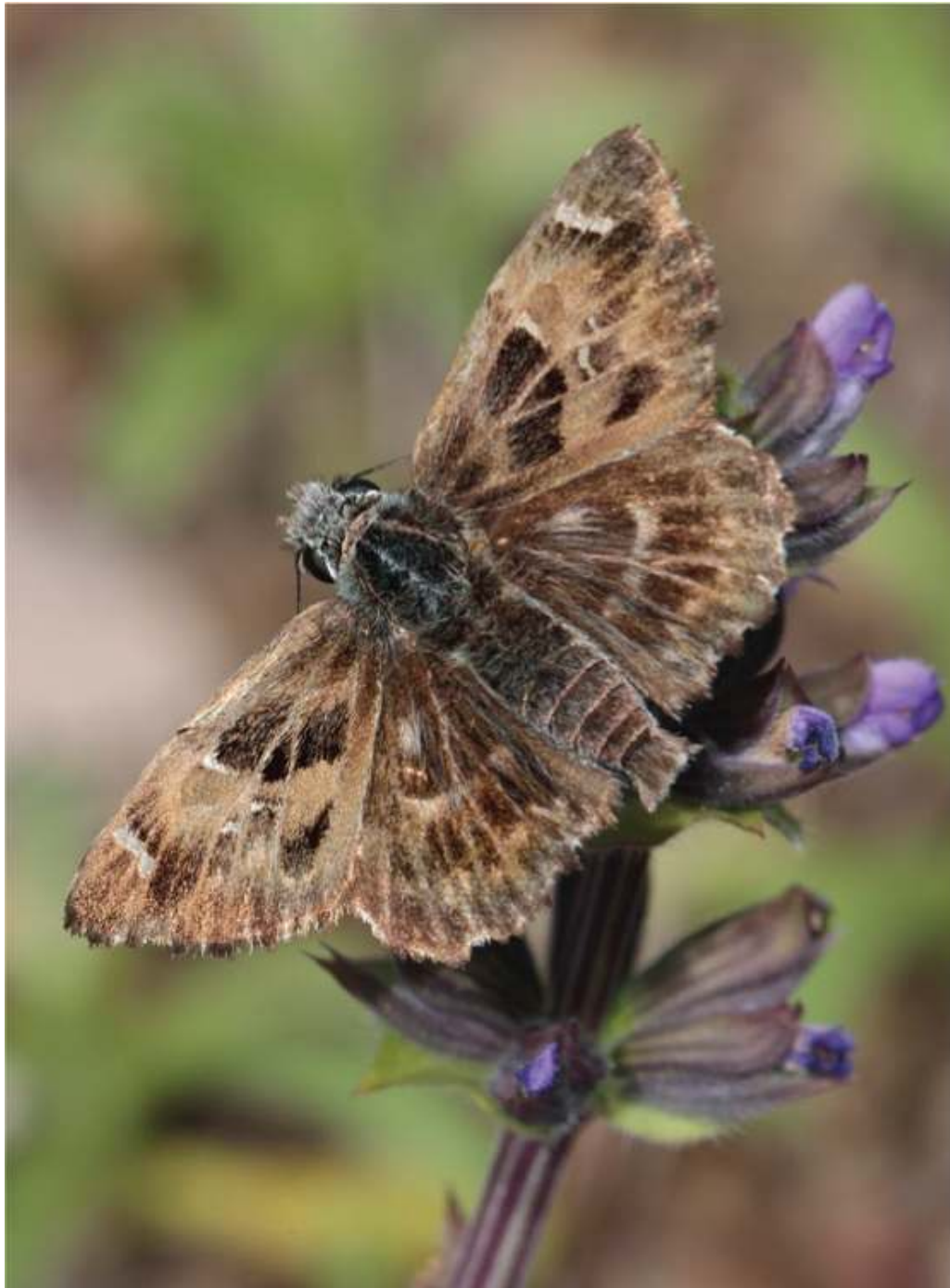
Mallow Skipper basking.

🦋 FLIGHT PERIOD One of the earliest species, appearing from March onwards, with several broods through to late summer; further south it may be present all year.