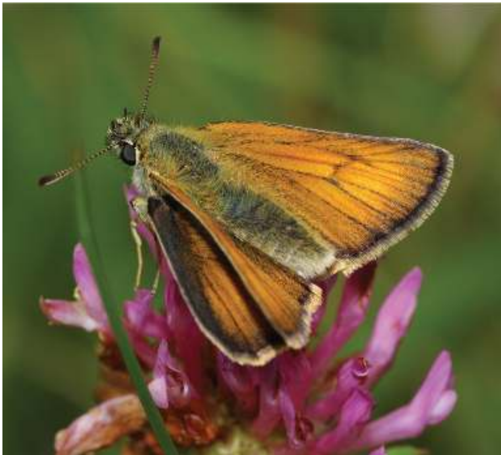
Female Small Skipper on Red Clover.

FLIGHT PERIOD Flies in a single generation, early June–late August in the UK, although may emerge much earlier in sites further south.