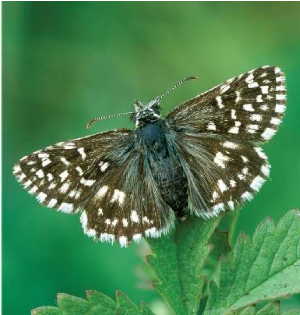
Grizzled Skipper adult basking.

larger, with a wingspan of up to 34mm, and smaller and fewer spots. It occurs in similar habitats and is widespread, although it is rare or absent from Denmark and Holland.