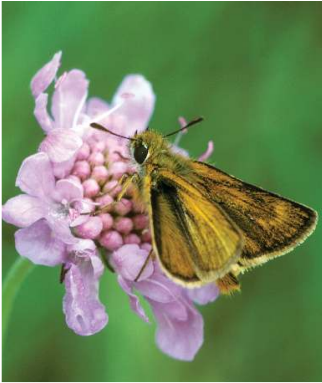
Male Lulworth Skipper on Scabious.

The other golden skippers, but reasonably easily separated by its small size, dark colour and the female's golden 'eye'.