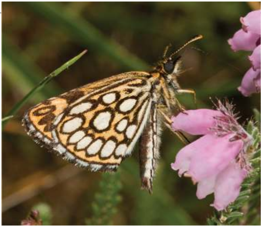
Large Chequered Skipper on Cross-leaved Heath.