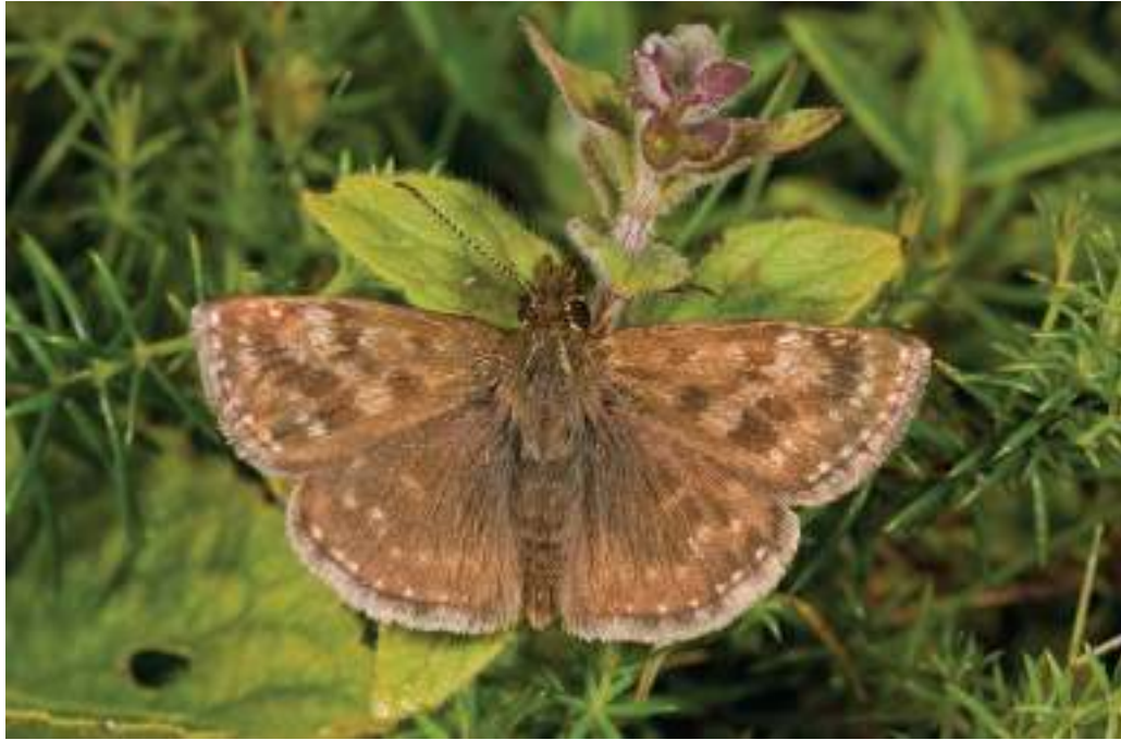
Dingy Skipper second brood adult on chalk grassland.