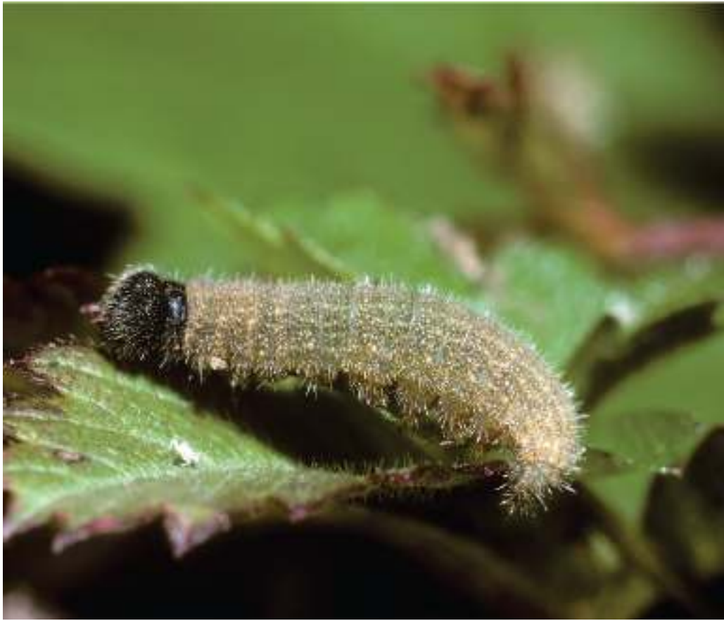
Grizzled Skipper larva feeding.

FLIGHT PERIOD Mainly late April–end June, with a small second brood in late summer. Favoured localities in warm seasons.