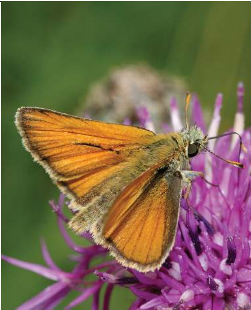
Male Small Skipper on Knapweed.

spotted and Lulworth), being most like the Essex Skipper (for distinctions).