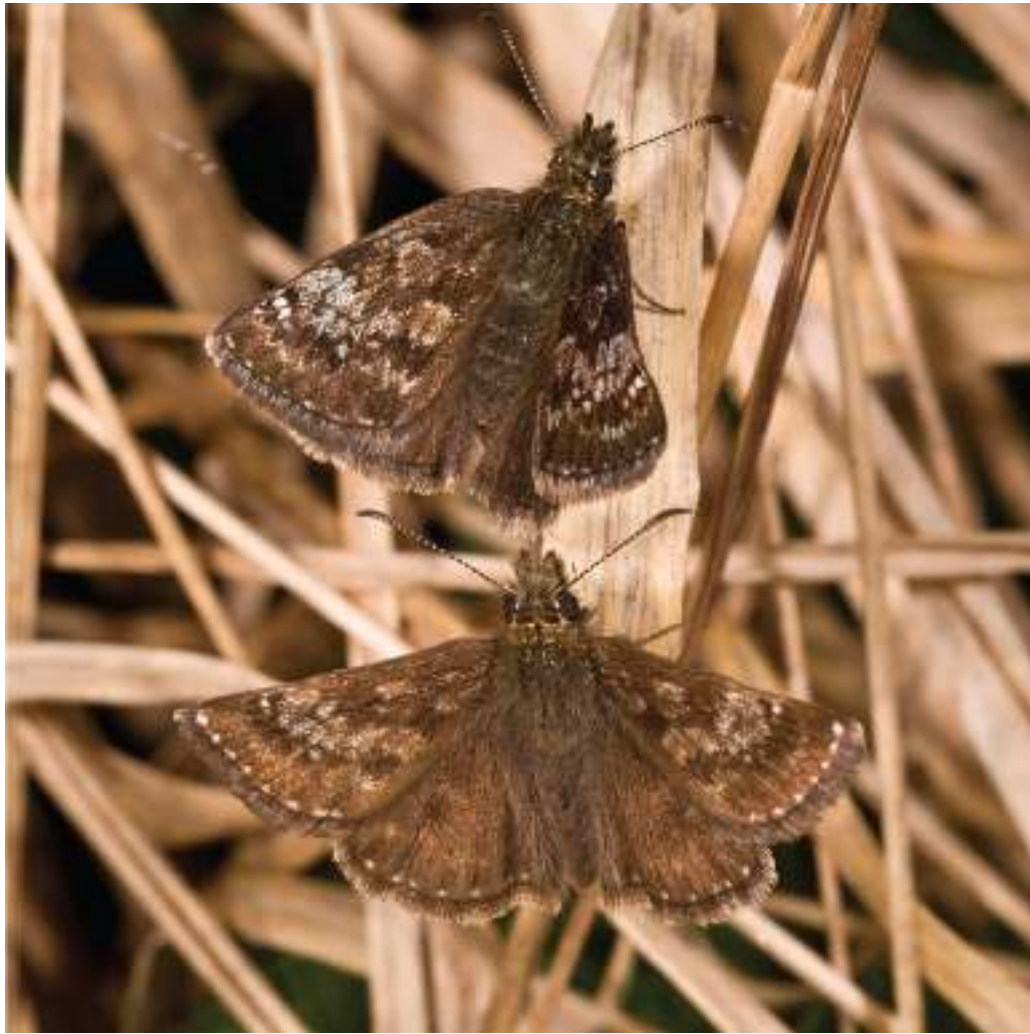
A courting pair of Dingy Skippers, male below.

which has orange underwings and antennae without any swelling, or Grizzled Skipper , which has more distinct chequered pattern, and chequered fringes to the wings.