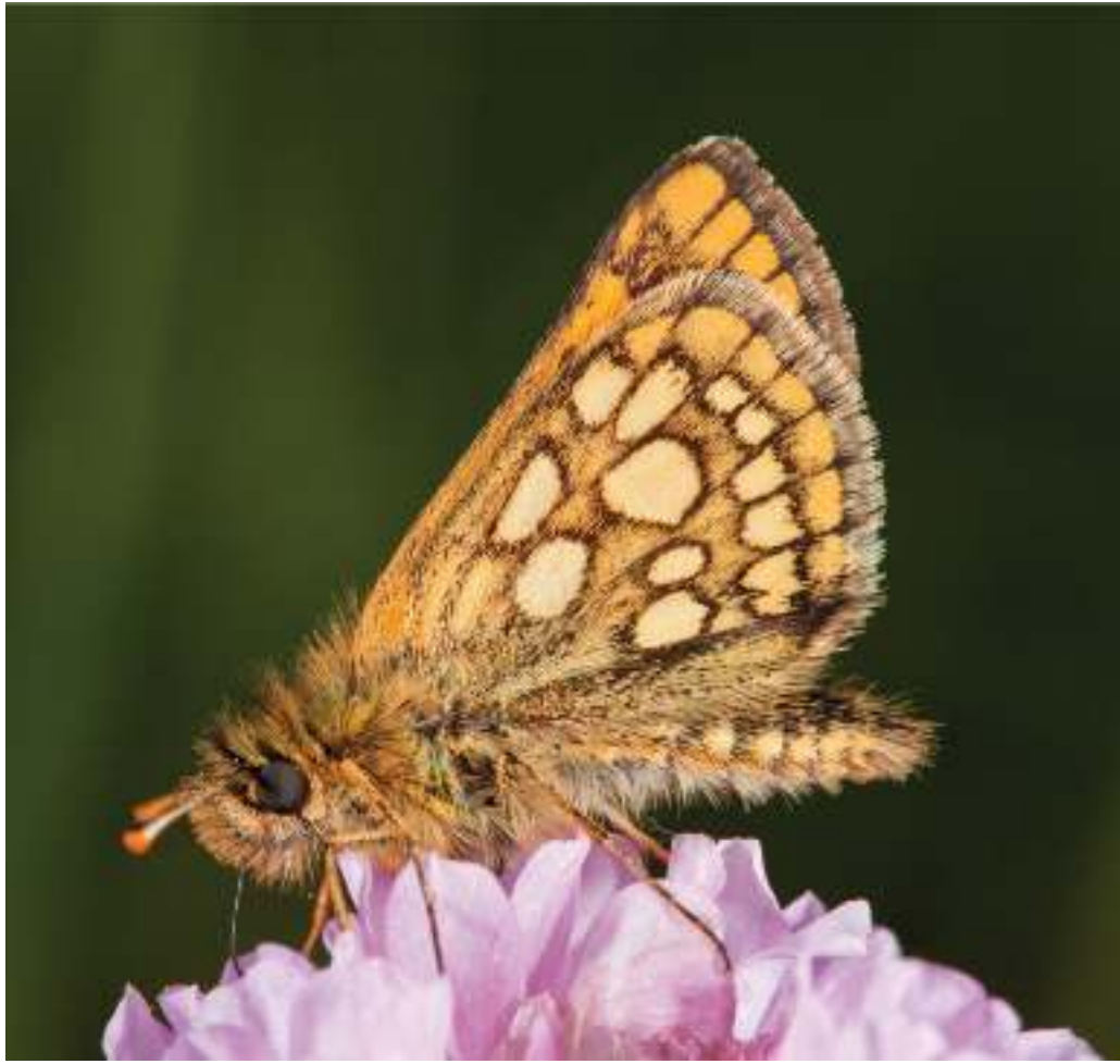
Chequered Skipper feeding on Thrift, showing underside.

FLIGHT PERIOD Late May–early July in most localities; rather later in montane sites, in a single brood.