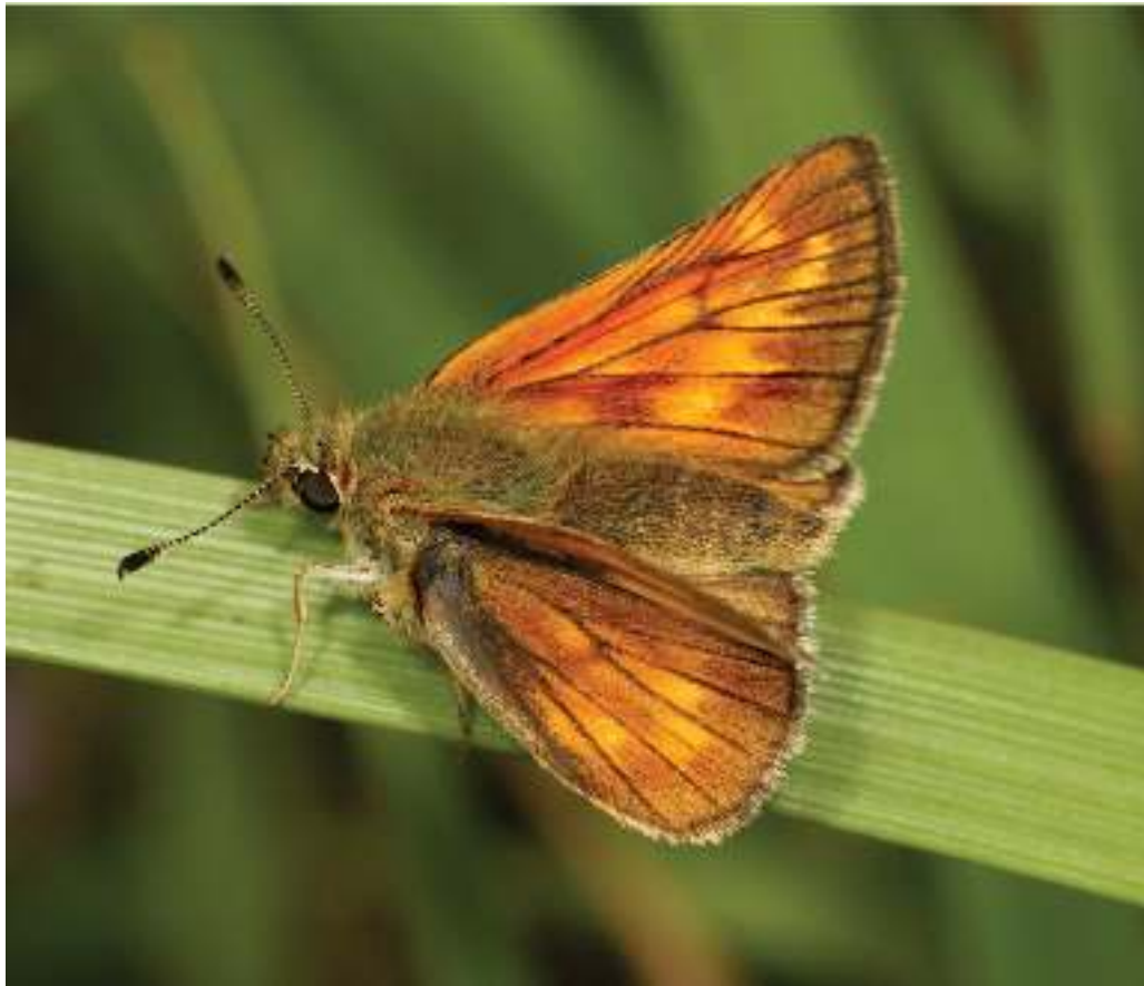
Female Large Skipper basking.

FLIGHT PERIOD The earliest of the golden skippers, with a single generation that lasts from May–early September (further south in Europe there may be a small second generation).