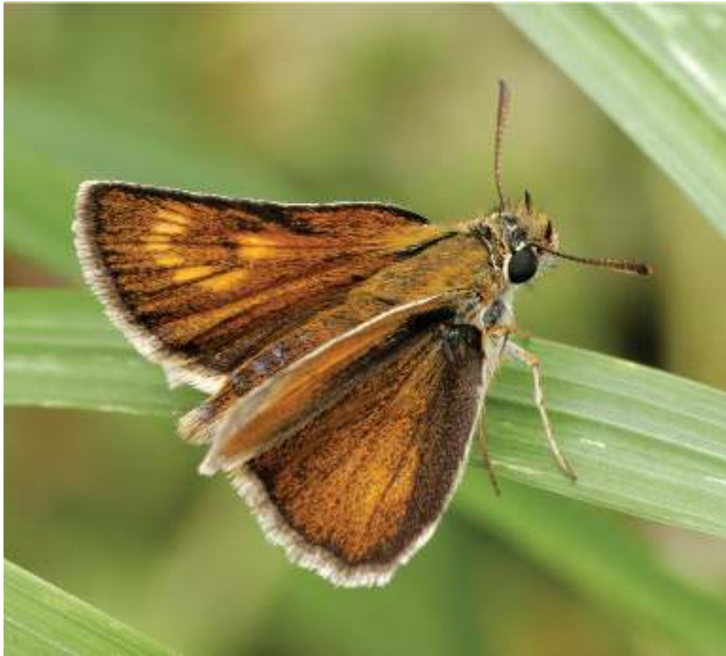
Female Lulworth Skipper, showing the circle of orange clearly.

FLIGHT PERIOD Single generation, although quite variable in its timing. In warm early years colonies it can be seen from May onwards in good years, although normally it emerges in June and flies until early September.