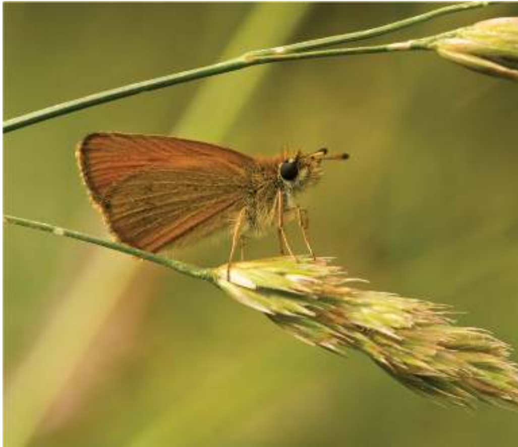
Male Essex Skipper showing underwings.

Wingspan 30mm. This little butterfly is very similar in almost every way to the Small Skipper , and was not recognised as a separate species until 1889. However, there are some distinct, small differences between the two species, and with practice it is easy enough to identify in the field. The most consistent and clearest difference lies in the antennae, which are boldly black tipped, particularly underneath, whereas in Small Skippers they are brown. To see this it is best to get below a settled butterfly and look up at it. In addition, Essex Skippers tend to be duller, paler brown, with more diffuse black margins, and the male sex brand is shorter and more exactly parallel to the front wing margin. There is a life-cycle difference, too: the Essex Skipper overwinters as an egg, while the Small Skipper overwinters as a larva. Essex Skippers particularly favour grasses such as Cocksfoot and Creeping Soft-grass in the UK, and use a wide range of grasses elsewhere.