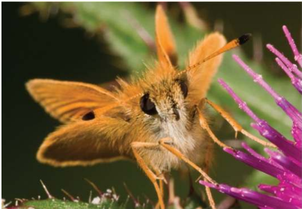
Essex Skipper showing undersides of black-tipped antennae.