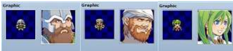
Figure 2-2. (From left to right) Palnor's sprite and portrait, Gust's sprite and portrait, and Feylia's sprite and portrait

Now, flip over to the Actors tab and create your three characters. First, add their sprites and portraits, as seen in Figure 2-2.