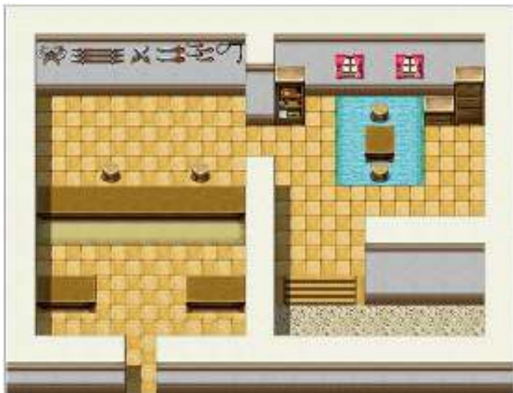
Figure 1-2. A screenshot of the Equipment Shop

maps, so that they would fit in a 17×13 tile space (this stops the map from scrolling while the player is on it). It gives the shops and the pub a neat little sense of coziness, in my opinion, anyway. Figures 1-2 to 1-4 contain the relevant screenshots. You'll notice the absence of the Item Shop among those screenshots, but I'm planning to do something neat with that near the end of the chapter. For the sake of consistency, I'll show the buildings in the same order as I noted them previously.