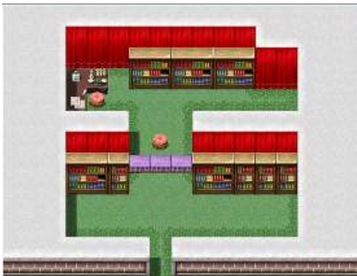
Figure 1-4. A screenshot of the Magic Shop

The Pub is the map that I had to tweak most. I started with the InnFIF sample map and tweaked it to the state you see in the preceding figure. This building will also have two NPCs. One will offer companions for hire, while the other will act as the town's innkeeper, allowing the player to rest between dungeon crawls.