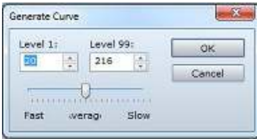
Figure 2-1. A screenshot of the Generate Curve window for the Mage's MHP stat

■ Note The slider bar below the curve values determines the speed at which the class gains that particular stat. You can make classes that gain the bulk of a stat early in their career and others that gain it later on. For the purposes of this game, leave all of these sliders on the default setting of Average.