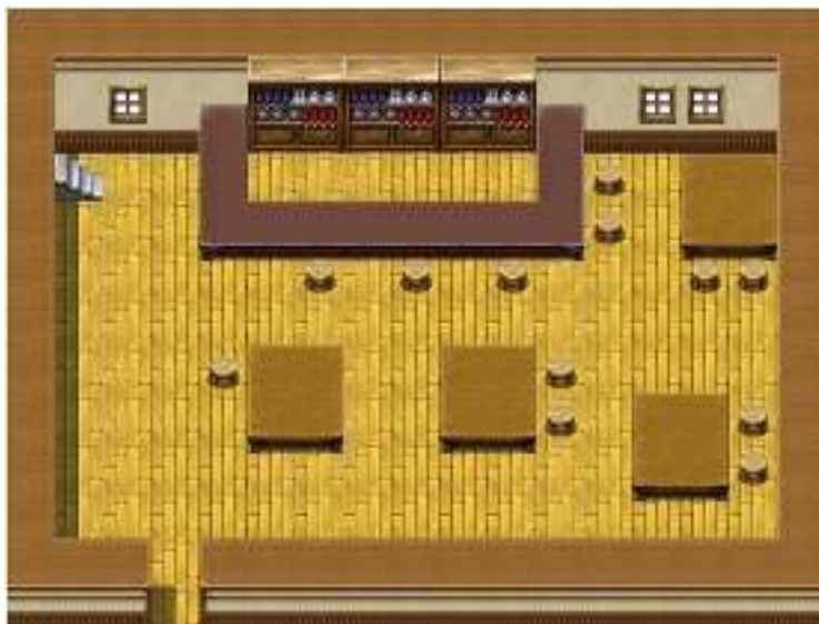
Figure 1-3. A screenshot of the Pub

The Pub is the map that I had to tweak most. I started with the InnFIF sample map and tweaked it to the state you see in the preceding figure. This building will also have two NPCs. One will offer companions for hire, while the other will act as the town's innkeeper, allowing the player to rest between dungeon crawls.